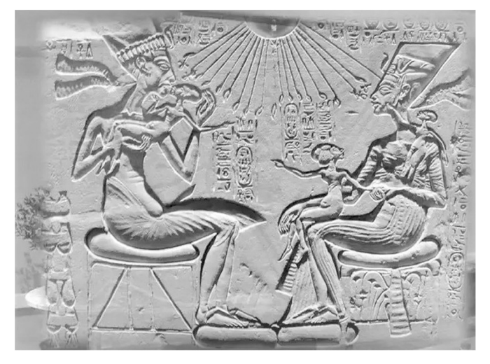
Fig. 1. An image showing Akhenaten, Nefertiti and three children exposing themselves and a house plant to the healing rays of sunlight. The religious symbols in the image suggest that the Ancient Egyptians venerated and worshipped the sun.

The Greeks and the Romans clearly recognized the healing power of the sun. They built solariums and sunbaths, and the Greeks even used them to enhance the strength of athletes preparing for the Olympic Games by exposing them to several months of sunlight treatment. The word, heliotherapy, actually derives from the Greek name for their sun god, "Helios"; heliotherapy meaning sunlight therapy [23–26]. Furthermore, Ayurvedic medical records show that as far back and 1400 BCE; Hindus used the combination of sunlight and photosensitive herbs, such as furocoumarins, to treat vitiligo and other conditions—a combined treatment, which many refer to today as photodynamic therapy [27]. Moreover, records indicate that heliotherapy was a